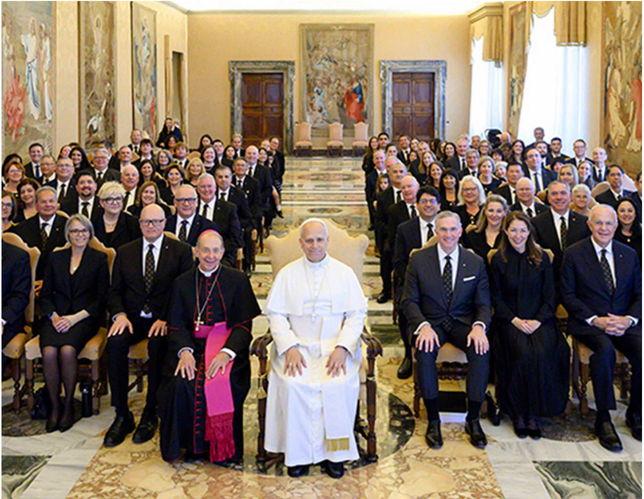
Pope Leo XIV and the Knights of Columbus Board of Directors are pictured together following the Oct. 6 audience in the Sala del Concistoro of the Vatican Apostolic Palace.

The 2025 Jubilee Year happened during the same time frame that the Knights of Columbus Board of Directors was to take its Board Pilgrimage trip, which happens every five years. This was a very special opportunity for us and to also coincide with the first year of the new pontificate of Pope Leo XIV it was truly an amazing experience.